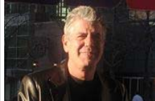
Cafe Society: Week in review