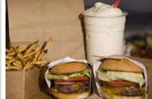
100 Favorite Dishes: Larkburger cheeseburgers