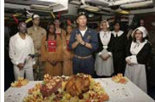
Thanksgiving traditions that should die. Now.